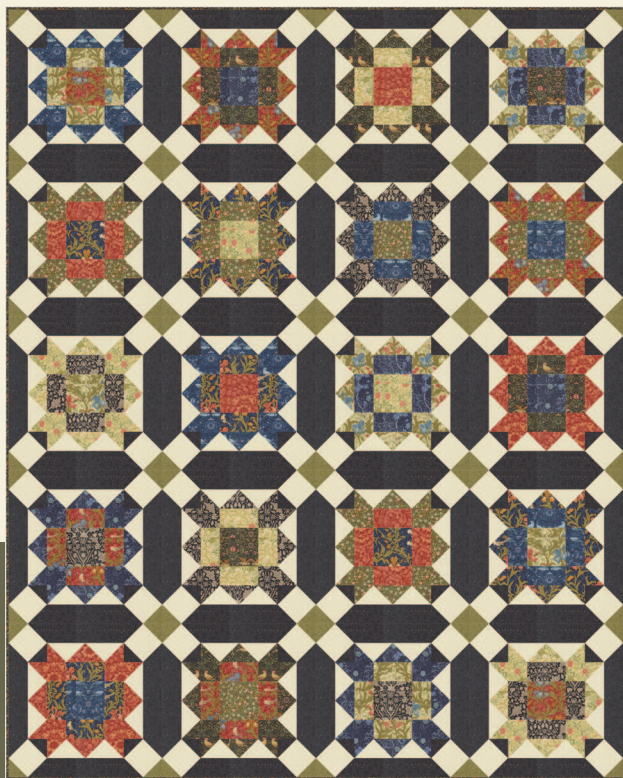
CKQ 2414 Wishy Washi 64" x 80" AB Friendly by Copper Kettle Quilt Company