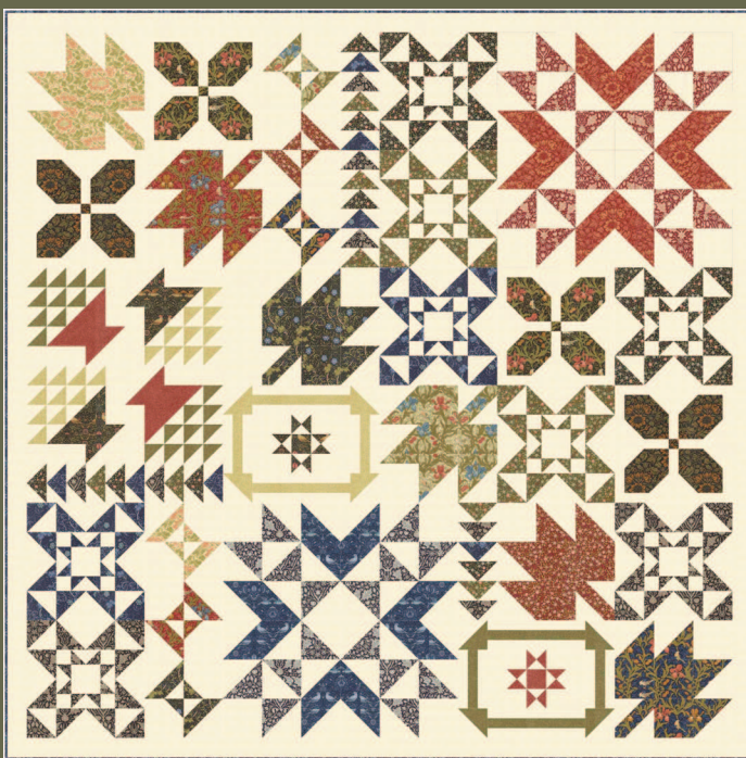
WS 107 Oh Happy Day 76" x 76" by Wendy Sheppard