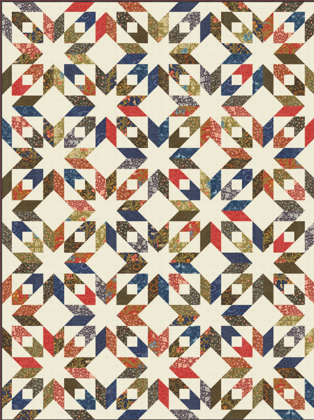
MM 018 Same Sky 60" x 80" by Modernly Morgan