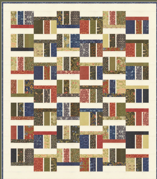
SS 570 Della 60" x 69" LC Friendly by Splendid Speck