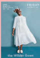
FPC 022 Friday Pattern Co Wilder Gown (adult)